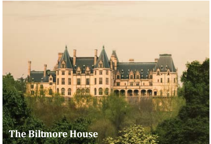
The Biltmore House

Attendees will have a choice for accommo-